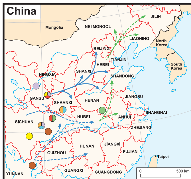
Fig. 2. Dispersal of the wheat yellow rust pathogen, Puccinia striiformis f. sp. tritici , in China. The main area of winter wheat cultivation includes Shaanxi, Shanxi, Henan, Hebei, and Shandong provinces. Solid blue arrows show dispersal of uredospores from southern Gansu province to the main wheat-growing area in autumn (35–38). Dashed arrows indicate additional proposed pathways of uredospore dispersal in autumn (blue) and spring (green) (39). Colored circles indicate sites where genotypes of P. striiformis f. sp. tritici with indistinguishable genetic fingerprints were found (40) (green, genotype 6; red, 10; purple, 34; blue, 35; orange, 36; brown, 39; and yellow, 46).

As in pathogen invasions, dispersal of virulent genotypes may be successful even when the density of susceptible hosts is low (28); neither Mla13 nor Yr17 , two genes discussed below, was deployed over a large area when cultivars carrying them first became susceptible (42). When a resistance gene is used widely, mutation to virulence in a single pathogen genotype may mean that previously resistant cultivars become susceptible across huge areas. In accordance with the prediction that unusual events may have a disproportionate effect on population dynamics (7), virulent clones may initiate local epidemics whether they are dispersed with the prevail-